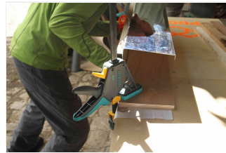
Guide 5: CPC Reflector