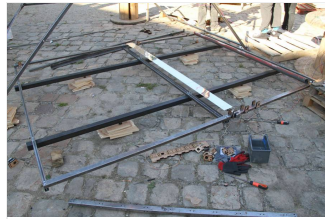
Guide 1: Support structure of