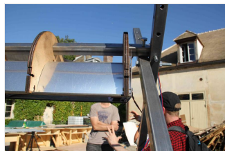
Guide 7: Assembling of the