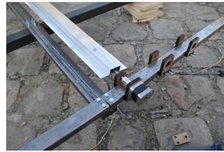
Guide 2: Mirror facets