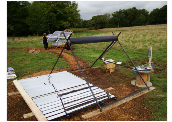
Guide 3: Support structure of