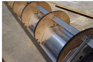
Guide 4: Skeleton of the