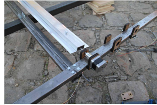
Guide 2: Mirror facets