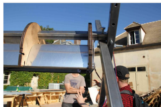
Guide 7: Assembling of the