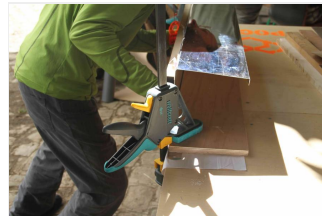
Guide 5: CPC Reflector