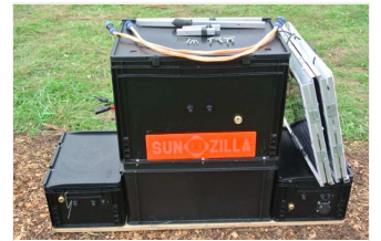
Guide 6: Setup Manual