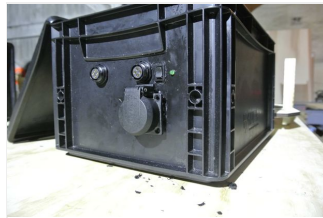
Guide 4: Solar box