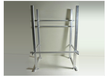
Guide 3: Solar box