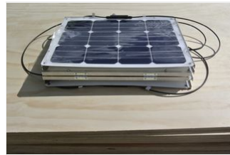
Guide 5: Assembling solar