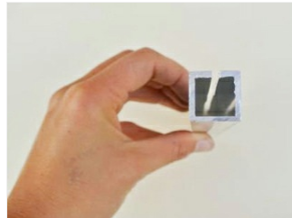
Guide 1: Preparing the