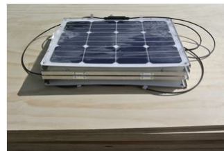
Guide 5: Assembling solar