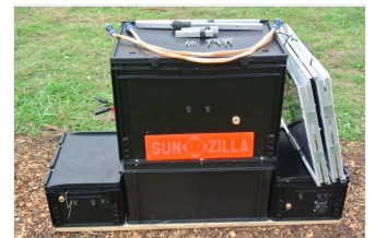
Guide 6: Setup Manual